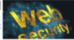
Elite Web Design & Development - Inspired & Engaging Design