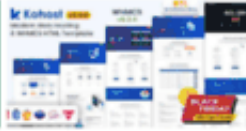
HTML - Page 10 of 181