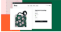
Build Your E-Com Website