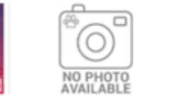
Nulled Scripts - Nulled Scripts