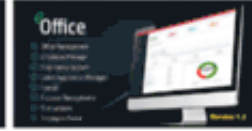
eOffice CRM v1.2 - (Accounts, HRM, Inventory, Sales)