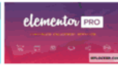
Elementor Pro v2.9.5