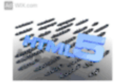
5-Day Wix Challenge - The Ultimate Wix Design Course