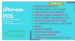
Ultimate POS v3.0 + Addons - nulled